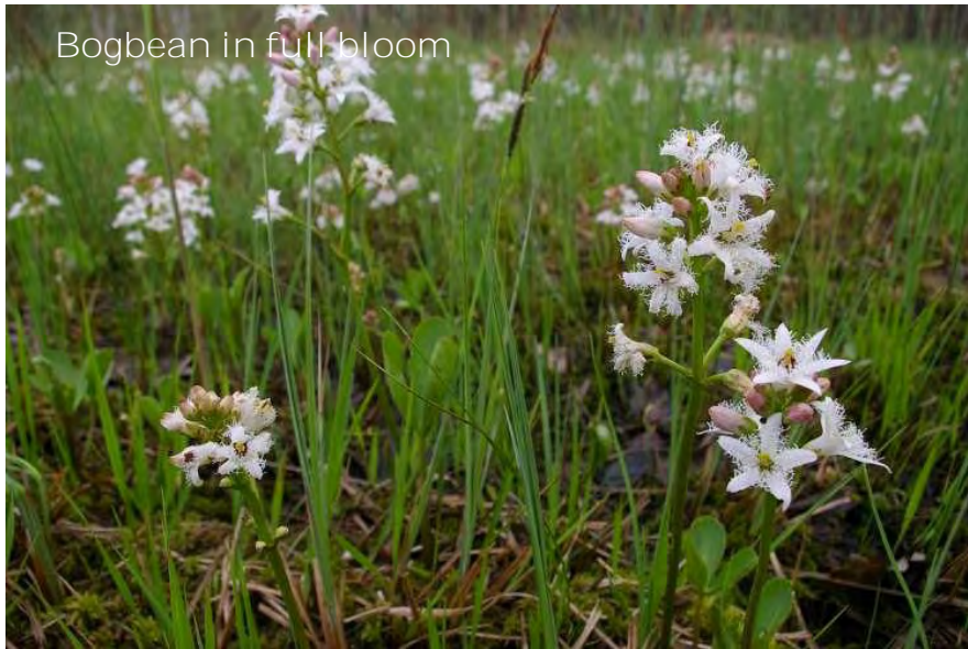
Bogbean in full bloom

Buckmoth can be found. This is a species of silk moth that feeds on a typical fen plant, Bogbean.