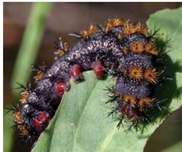
The endangered Bogbean Buckmoth and its caterpillar