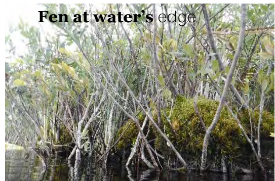
Fen at water's edge

The White Lake fen is also one of the few Canadian locations where the Bogbean