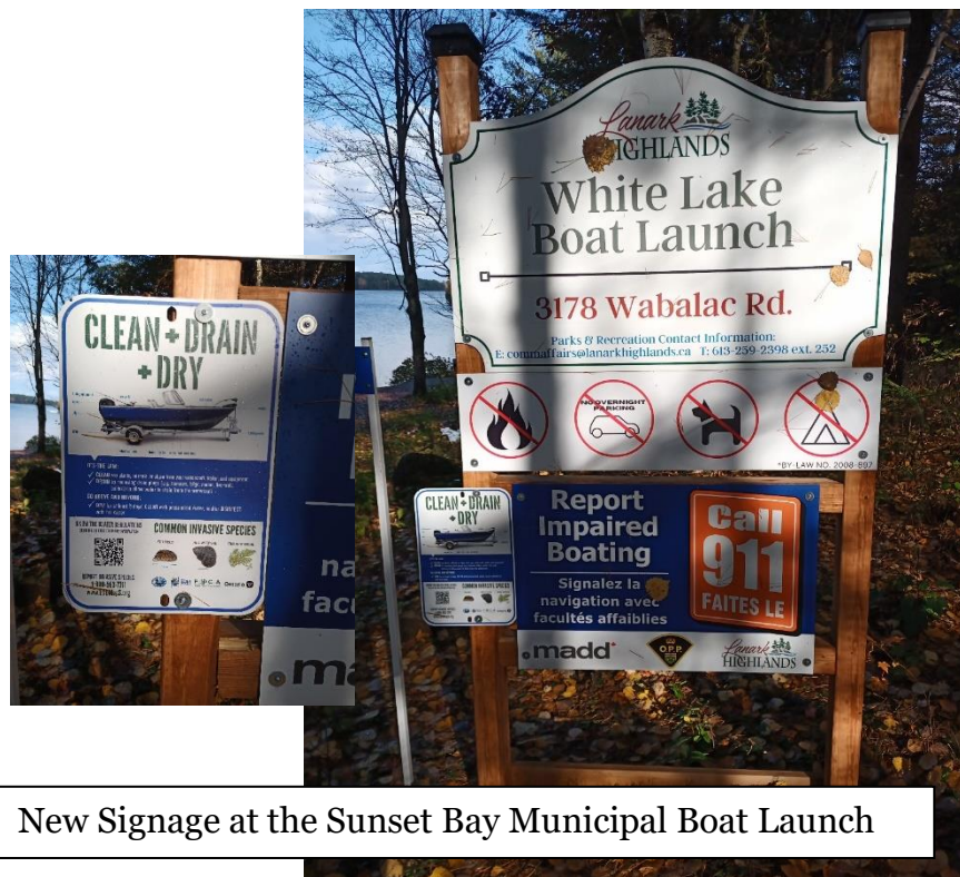
New Signage at the Sunset Bay Municipal Boat Launch

Sunset Bay Boat Launch: The boat launch and adjacent area saw improvements by Lanark Highlands Township. In addition to installing a portable toilet, bear-proof garbage container, emergency pin number and a picnic table, a large sign was erected containing important information about boating safety, etc. Of note to us is a sign concerning the control of invasive species entering or leaving the lake. The sign is pictured below.