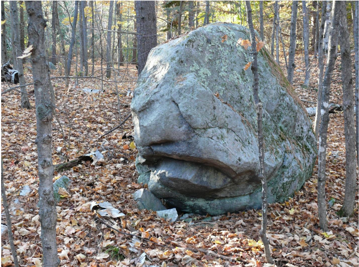
“The Old Man of the Forest”